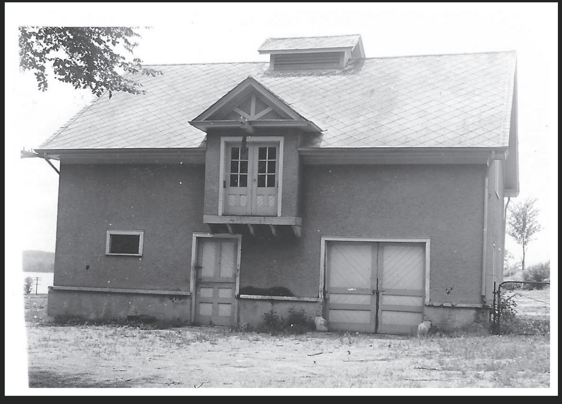
Overview of Barn in 1941 (note the stucco exterior), facing west.