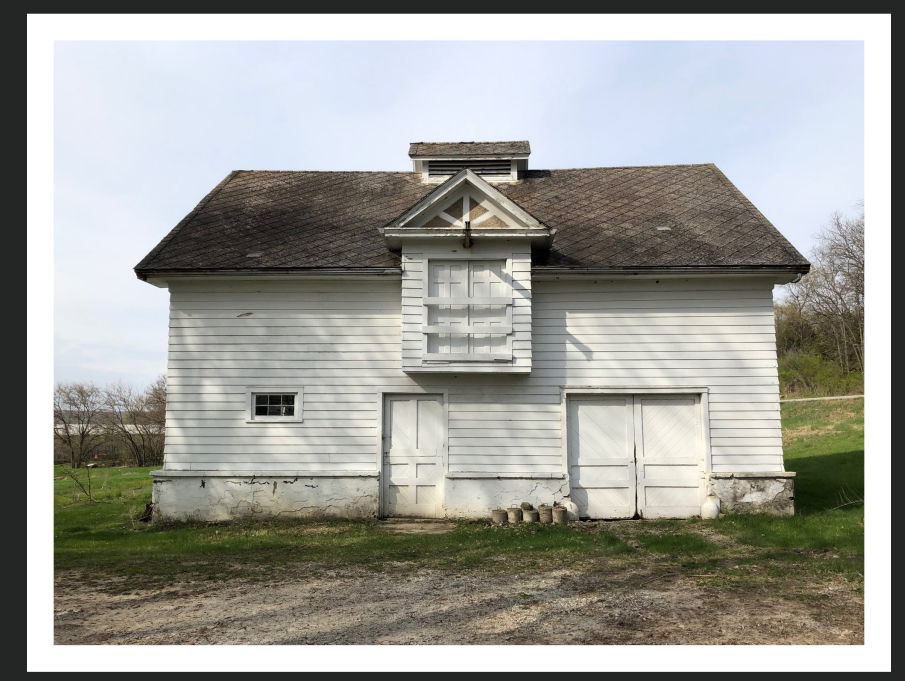
Overview of Barn in 2021, note wood siding has replaced stucco, facing west. Note: Original pebble-dash stucco can be seen in the gable between the decorative stickwork.